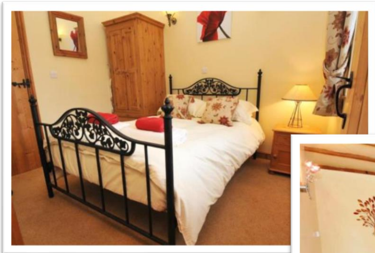
Guillemot's double bedroom and Puffin's living area.