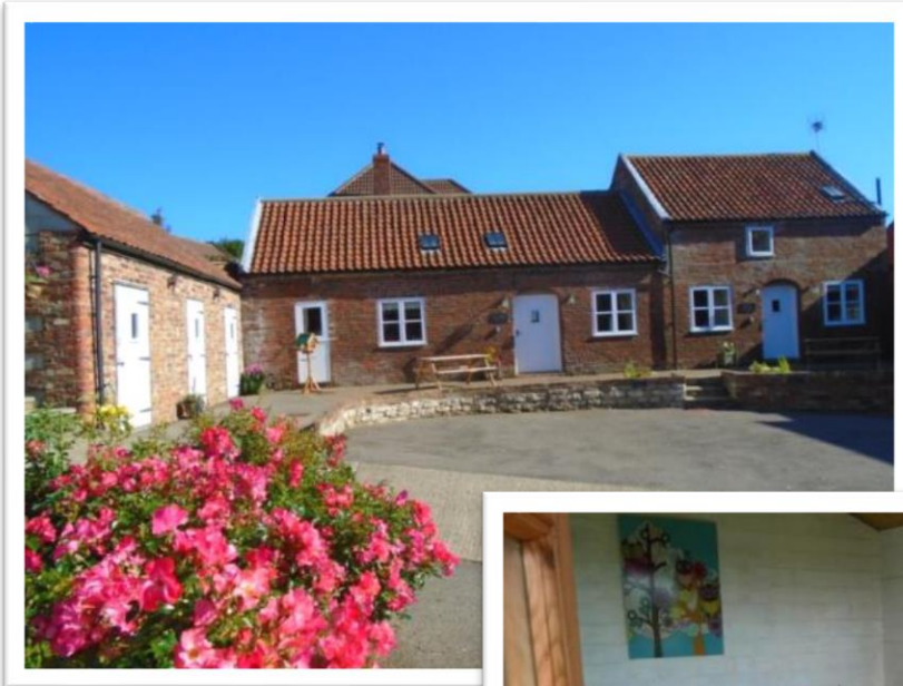
'The Courtyard' - showing car parking space outside the cottages (left) and the summer house in the shared gardens (below).